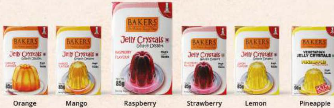
Jelly Crystal Mix Powder Net. Wt : 85 g Box