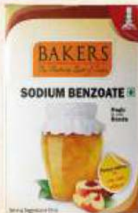
Sodium Benzoate Net. Wt : 50 g Box 1Kg Pouch