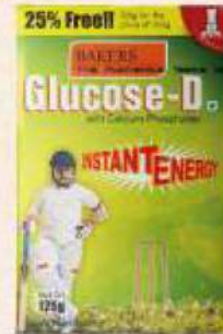
Glucose - D Net. Wt : 100 g Box 50 g Box