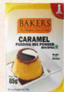
Caramel Pudding Mix Powder

Net. Wt : 100 g Box | 100g jar 250 g jar