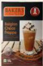
Belgian Choco Frappe