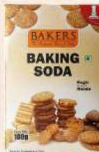
Baking Soda Net. Wt : 100 g Box