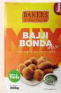
Baji Bonda Mix Net. Wt : 200g Box