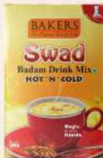
Swad Badam Drink Mix