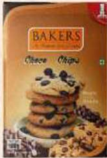
Choco Chips Net. Wt : 100 g Box 1Kg Pouch