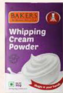
Whipping Cream Powder Net. Wt : 1Kg Pouch | 500g Box 100g Box | 50g Box