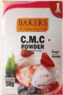
C.M.C Mix Powder Net. Wt : 50 g Box 1Kg Pouch