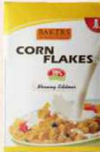
Corn Flakes Net. Wt : 500 g Pouch