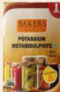
Potassium Metabisulphite Net. Wt : 50 g Box 1Kg Pouch