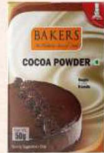
Cocoa Powder Net. Wt : 50 g Box 100g Jar | 250g Jar