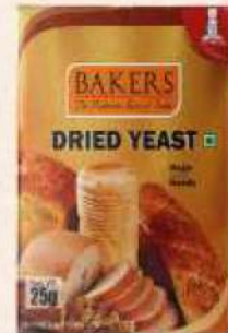
Dried Yeast Net. Wt : 25 g Box