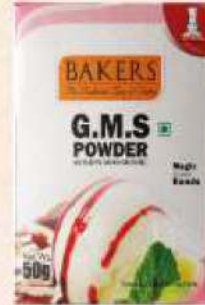
G.M.S Mix Powder Net. Wt : 50 g Box 1Kg Pouch