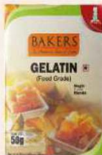
Gelatin Net. Wt : 50 g Box 1 Kg Pouch