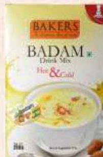
Really Badam Drink Mix Powder