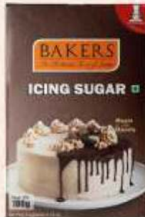
Icing Sugar Net. Wt : 100 g Box 250g Jar