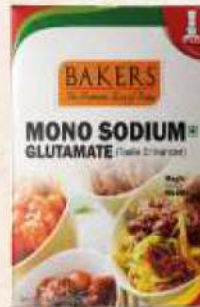
Mono Sodium Glutamate Net. Wt : 25 g Box