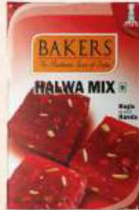
Halwa Mix Net. Wt : 200 g Box 25kg Bag