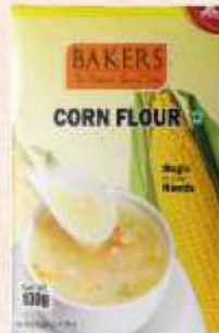
Corn Flour Net. Wt : 100 g Box 200g Box