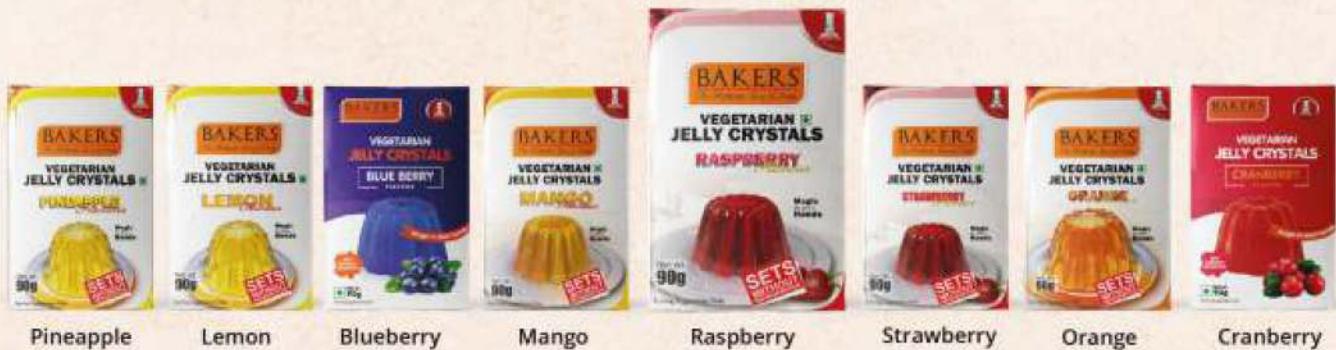
Vegetarian Jelly Crystal Mix Powder Net. Wt : 90 g Box