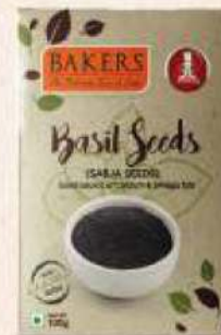
Basil Seeds Net. Wt : 100 g Box