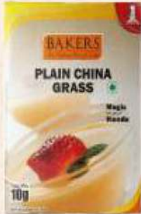
Plain China Grass Net. Wt : 10 g Box 10g Pouch