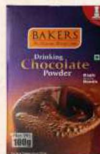
Drinking Chocolate Powder

Net. Wt : 100 g Box | 100g jar 250 g jar