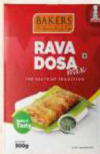
Rava Dosa Mix Net. Wt : 500 g Box