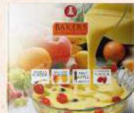
Variety Custard Mix Powder Net. Wt : (4 x 25g) 100 g Box