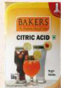
Citric Acid Mix Powder Net. Wt : 50 g Box