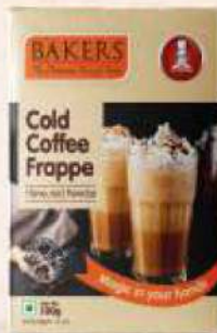
Cold Coffee Frappe