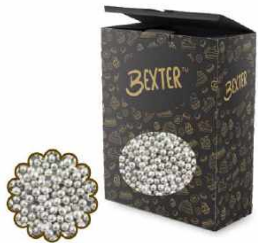
Silver Balls "3"