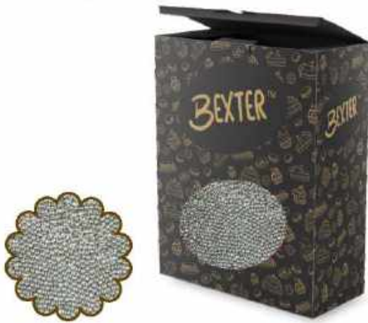
Silver Balls "0"

Bexter's range of the best ever shine silver balls are edible. Completely contains the taste of sugar. Due to the semi hard texture, its existence remains last long or even on the wet surface. The various shapes silver balls are reflective in light effect and enhance the celebration moments. These edible balls are beautiful for adding decoration to your cakes or cookies.