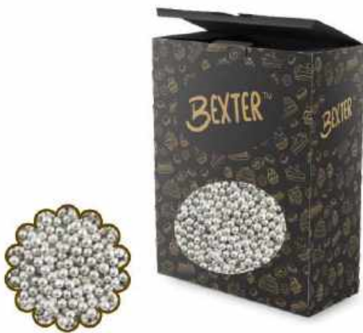
Silver Balls "2"