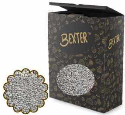
Silver Balls "1"