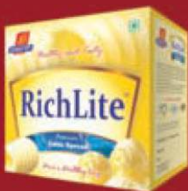
Table Spread Mixed Fat Spread